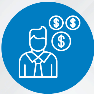
Sales & Support Management

VAC CRM is a powerful tool that captures leads from social media platforms like, Facebook, Linked In, and Google ads. VAC CRM stores all customer details from leads, identifies sales opportunities, manages marketing campaigns, records service issues, and all in one central location.